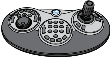
KBD5000 Jog/Shuttle, Keypad, and Joystick