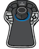
Enhanced 3D Mouse