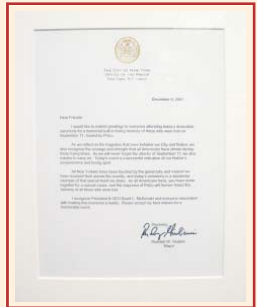
Words of appreciation to Pelco from the New York Mayor, Rudolph Giuliani. (Wall #7)