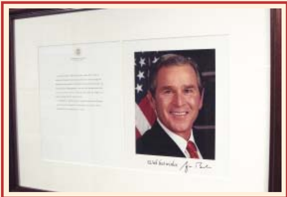
Words of appreciation to Pelco from President George W. Bush. (Wall #7)