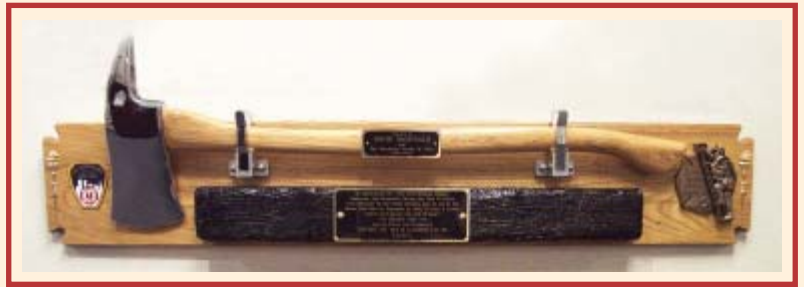
A very special gift ax from FDNY Officers and Firefighters of Engine Company #164 and Ladder Company #84. (Wall #6)