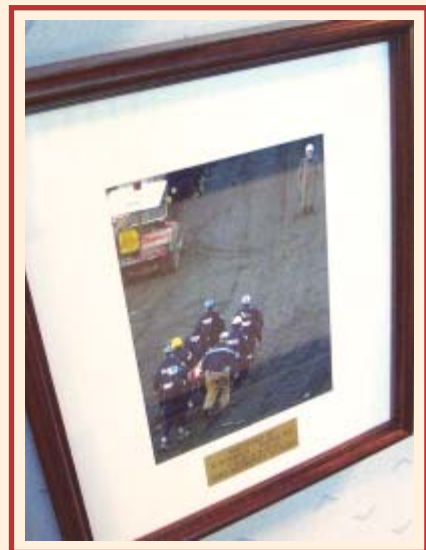
Photograph of the recovery of Port Authority K-9 Sirius, Badge #17. (Wall #8)