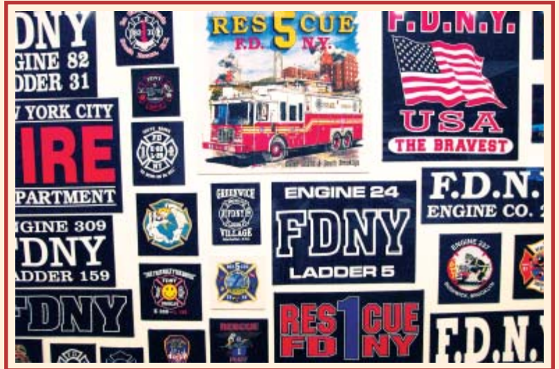
Collection of FDNY commemorative T-shirt art. (Wall #7)