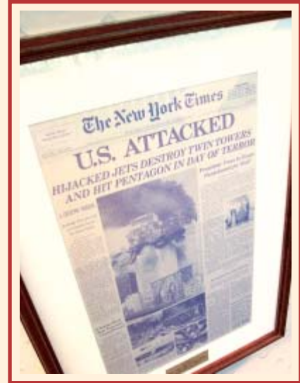
Original New York Times printing plate from September 12, 2001. (Wall #8)