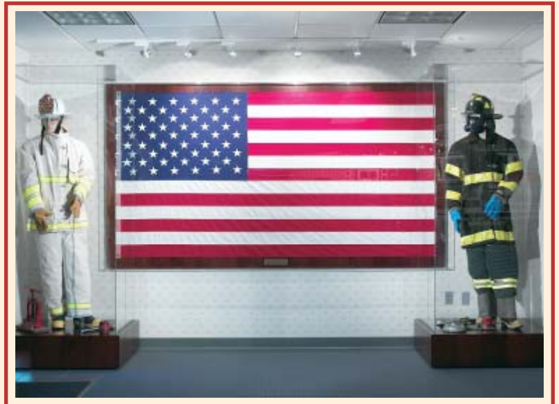
Actual Firefighter uniform worn during Ground Zero rescue operations (right). Firefighter uniform presented to David L. McDonald from City of Clovis Fire Department (left). Center – Actual American flag flown by FDNY Truck #10 on September 11, 2001 – during rescue and recovery operations. (Wall # 1)