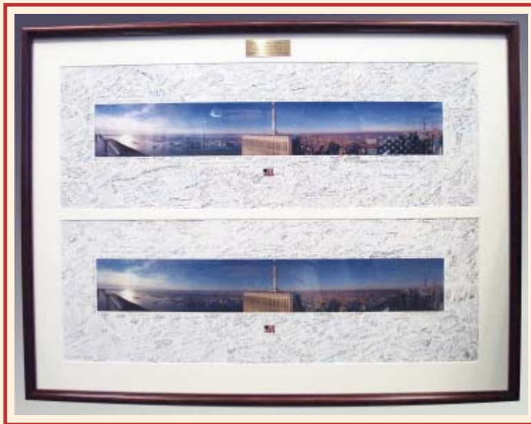
World Trade Center photographs signed by Fire and Police personnel who participated in World Trade Center rescue and recovery operations. (Wall #7)