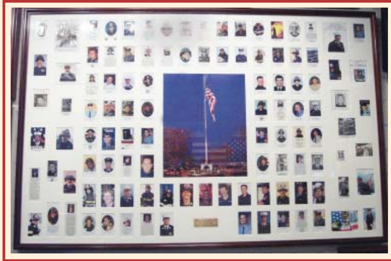
Photographs and remembrances as placed on California Memorial Monument the day of the memorial dedication, December 8, 2001. (Wall #7)