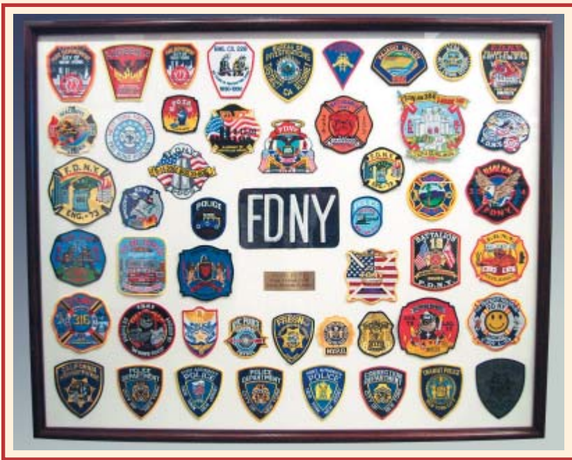
NYPD, FDNY, Port Authority, and Fresno/Clovis Officer Patches. (Wall #7)