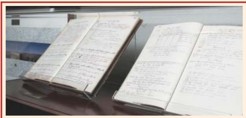
Official Log Book from FDNY #758, Hose Wagon #157 from April - October, 1920; and the Official Log Book from Fresno Fire Department Engine #3, Truck #2 from October - December 1953. (Wall #7)