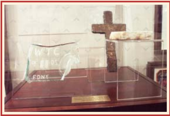
Steel, glass, marble and concrete fragments recovered from World Trade Center site — September, 2001. (Wall #7)