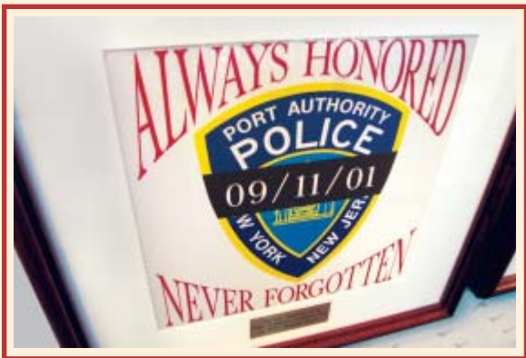
Actual sign from Port Authority Command Post at World Trade Center Ground Zero. (Wall #8)