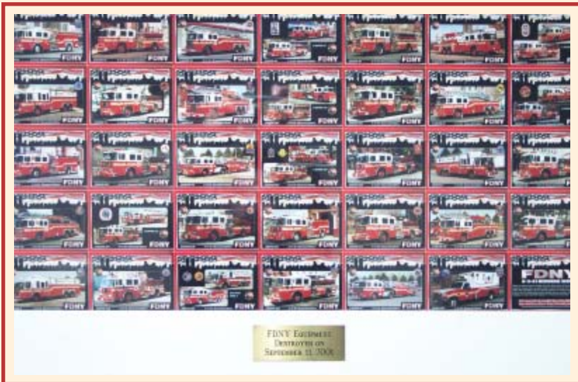
A collection of photographs representing all of the FDNY equipment destroyed on September 11, 2001. (Wall #3)