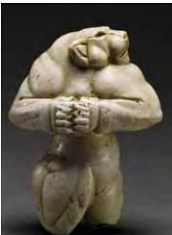
At just 3 1/2" high, the precious Guennol Lioness sculpture brought a record $57 million.