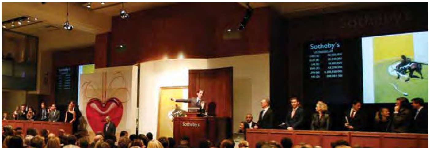
OPPOSITE: Pierre-Auguste Renoir's Le Bal au Moulin de la Galette sold for $78.1 million in 1990. BELOW: Sotheby's New York, Contemporary Art Evening Auction, November 2007.

Founded in London in 1744, Sotheby's offices are now located in 40 countries throughout the world. The scope and scale of this well-known auction house has grown considerably since its early beginnings, and only in the last century has it expanded from book auctions to cover all areas of the fine and decorative arts.