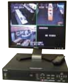
DX4000 DIGITAL VIDEO RECORDER