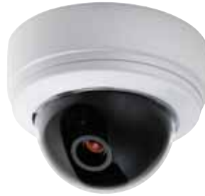
SPECTRA MINI DOME CAMERA