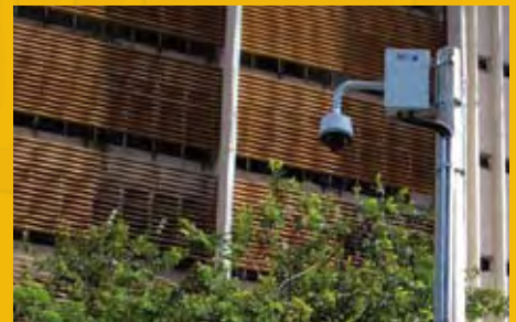
Video Security for Exterior Surveillance