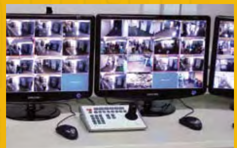
Intuitive and Powerful Control